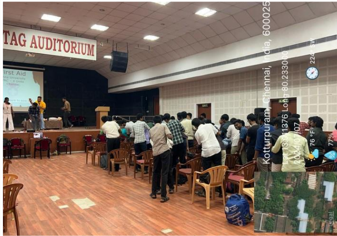
First Aid Event